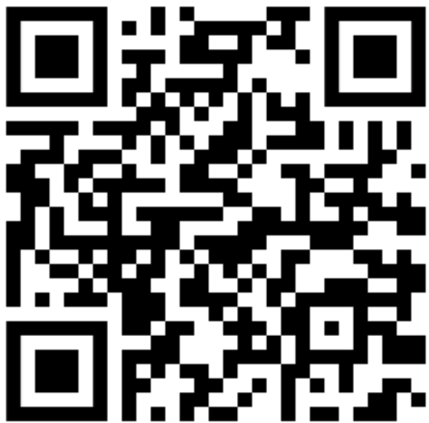
Active Learning Techniques Website

https://ctlsites.uga.edu/activelearning/